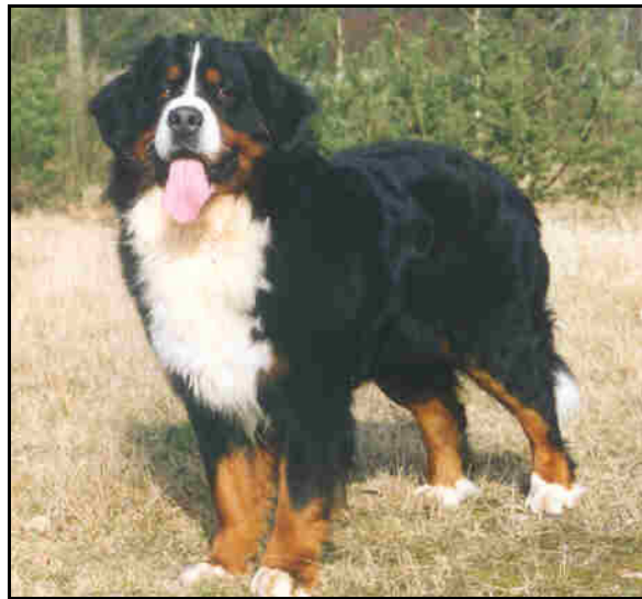
Pjotter van de Samaika