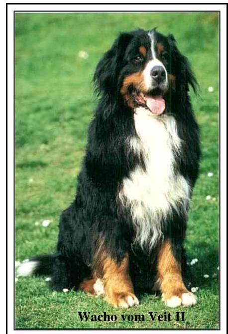
Wacho vom Veit II