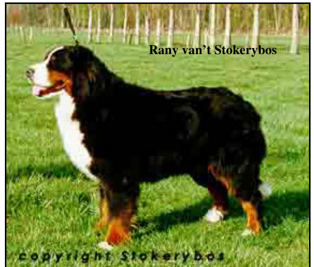
Rany van't Stokerybos