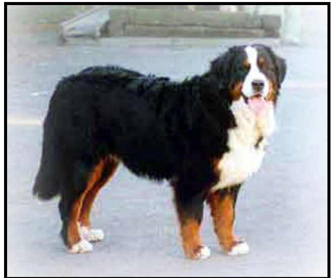
Dam: Xiera van't Stokerybos