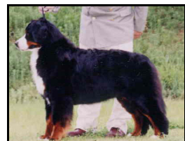
Ambrosia van't Stokerybos