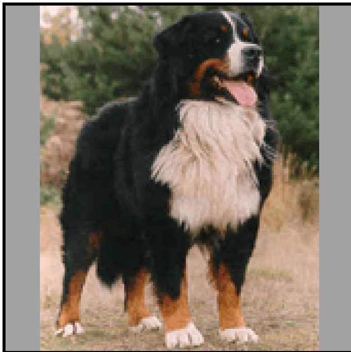
Paternal Grandsire and Maternal Great Grandsire: Int CH Qaey van de Klaverhoeve